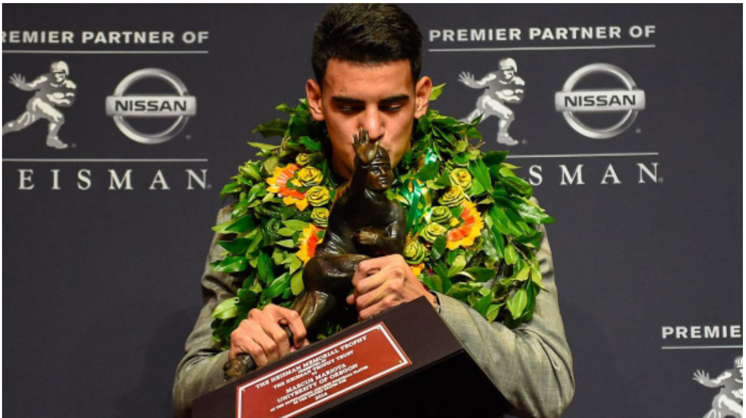
Mariota wins Heisman after an almost unanimous vote. (Pg.4) Mariota displays talent in rout of beating Michigan State. (Pg. 3)